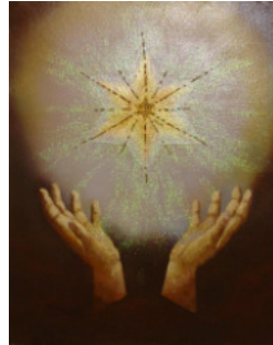
Starlight approx 16”x 20” £45.00 acrylic on canvas